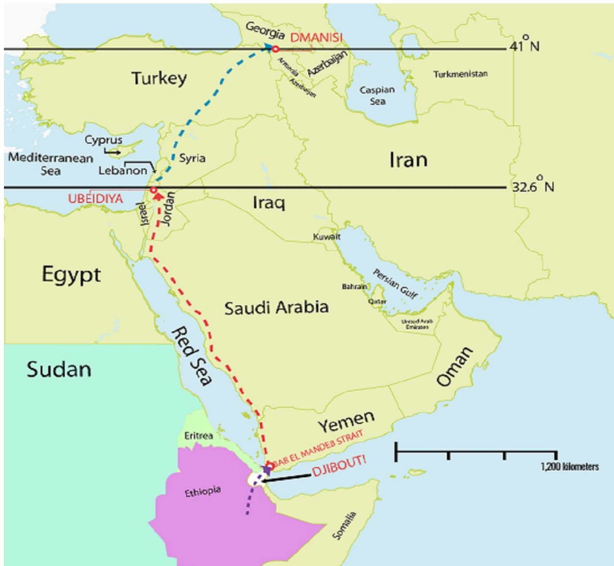
Figure 4 – Close-up view of the Middle East route taken by H. erectus hominins (1.8 – 1.6 mya) after migrating over the Bab el Mandeb-land bridge at a time of lower sealevel during the Pleistocene Epoch, followed by their northward migration along the western coastline of the Arabian Peninsula, and then up to Ubeidiya, Israel, and further northward to Dmanisi, Georgia. The optional route where hominins elected to take when they were within the southern part of Eurasia is not shown in this figure but is shown in Figure 3.